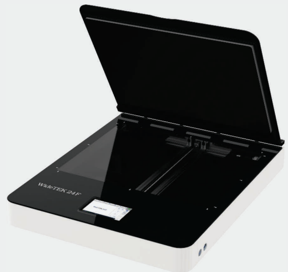
Scratch resistant glass plate enables scanning oversized originals