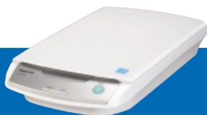
KV-SS080 (Optional Flatbed Scanner)