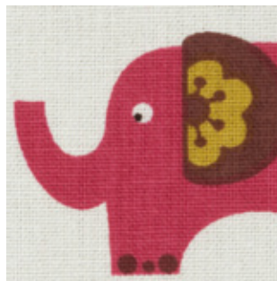
▶ Before applying with the Texture Smoothing function

This software is specifically designed for digital textiles and printings, offering many image improving functions, such as Texture Smoothing, Luminosity Sharpen and Detail Enhancement. ScanWizard DTG is good for using on printing digital patterns in textile, printing, dyeing and ready-to-wear industries.