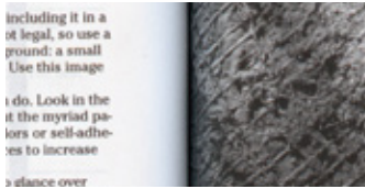
▶ Two-way LED light source Fewer shadows