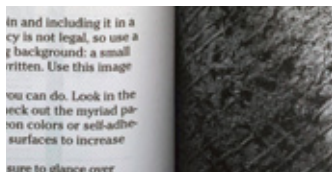
▶ One-way LED light source More shadows