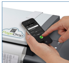
Cloud enabled with PageDrop