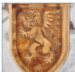
Odd-size materials – carvings