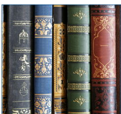
Odd-size items – books