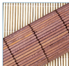
Wood, bamboo and similar