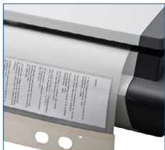
Oversize document scanning

The large flatbed surface provides great flexibility for creativity, careful document handling, oversized and book scanning.