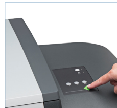
One-touch scanning: The entire image in just 4 seconds