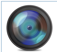
One camera, one perfect image, no stitching